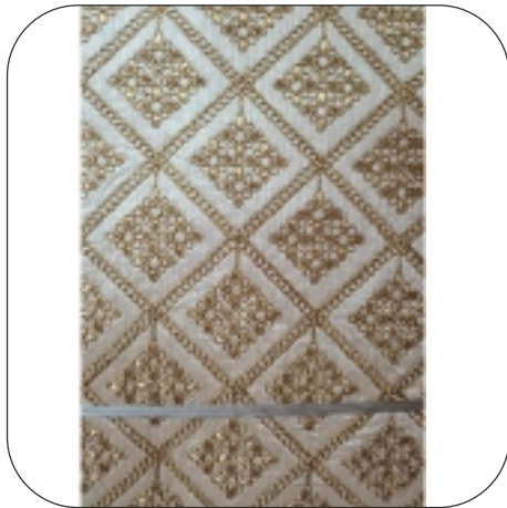
Heavy Embroidered Sherwani Fabric