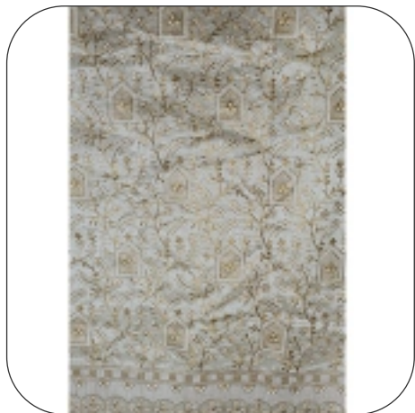
Fine Embroidered Sherwani Fabric