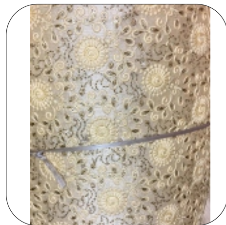
Velvet Embroidered Sherwani Fabric