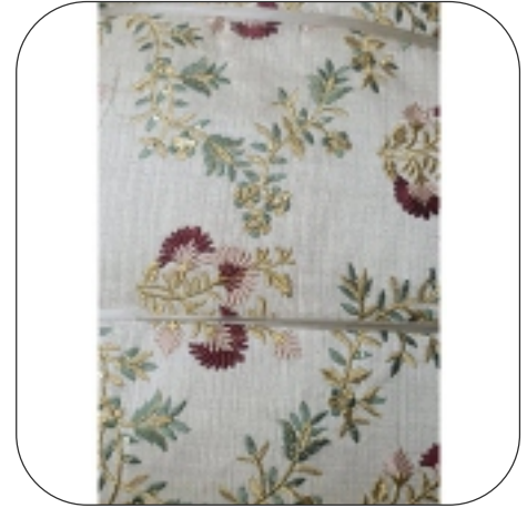
Indo Western Sherwani Fabric