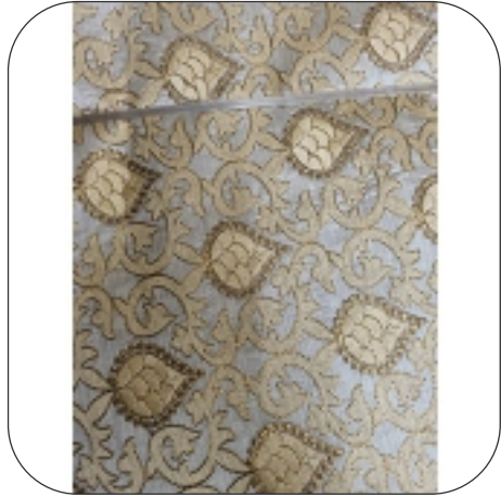
Brocade Sherwani Fabric