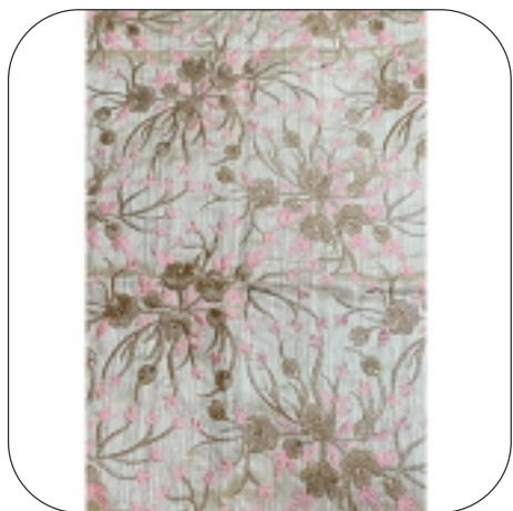
Party Wear Sherwani Fabric