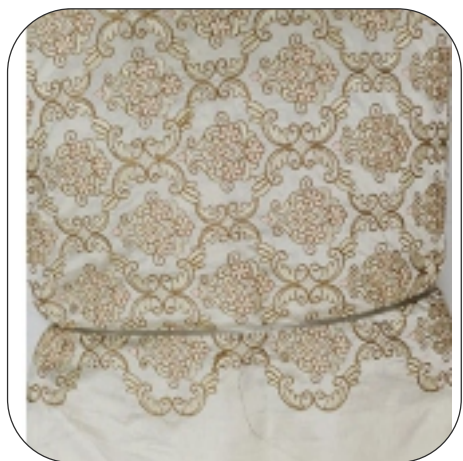
Georgette Sherwani Fabric