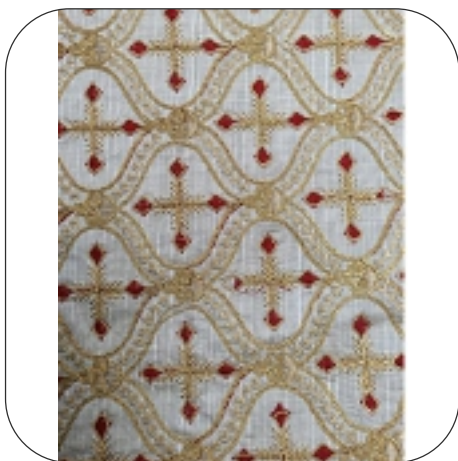
Stylish Sherwani Fabric