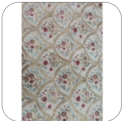
Embroidered Sherwani Fabric