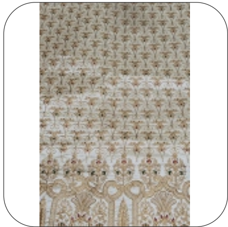
Modern Sherwani Fabric