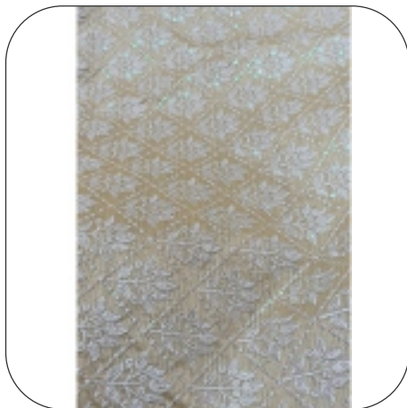
Readymade Wedding Sherwani Fabric