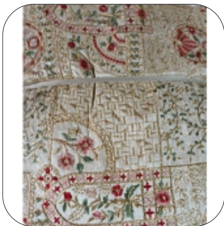
Heavy Designer Sherwani Fabric