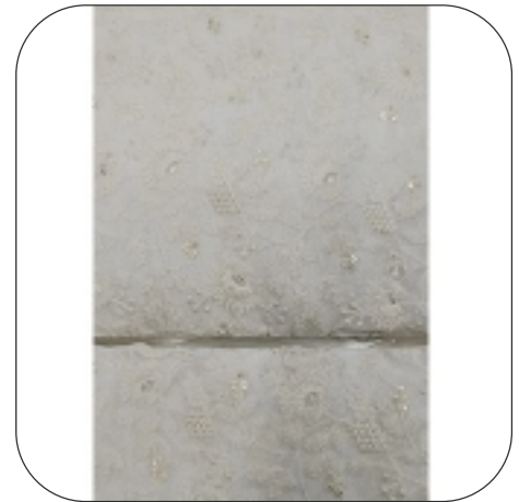
White Sherwani Fabric