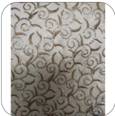
Designer Sherwani Fabric