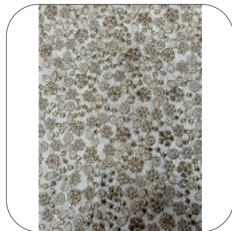
Velvet Sherwani Fabric