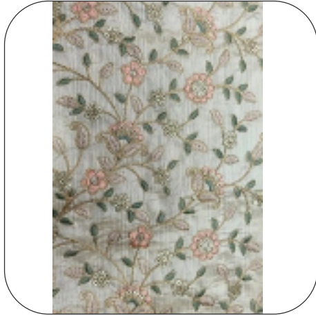
Fancy Sherwani Fabric