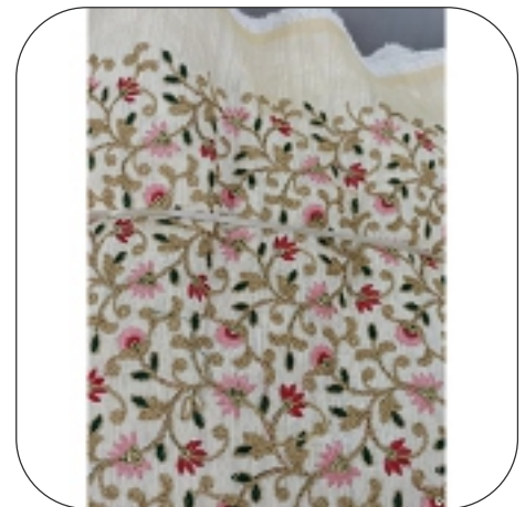
Flower Embroidery Work Sherwani Fabric